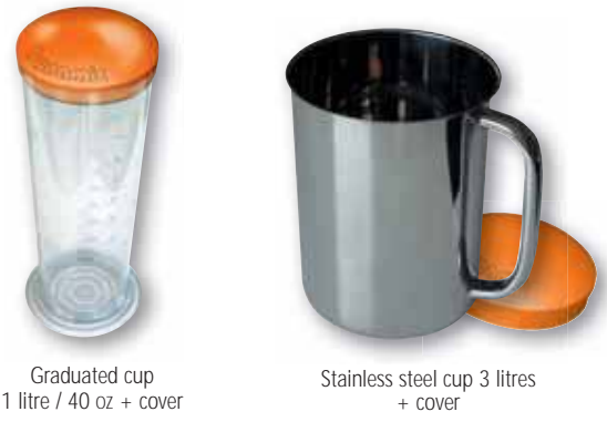
Graduated cup 1 litre / 40 oz + cover