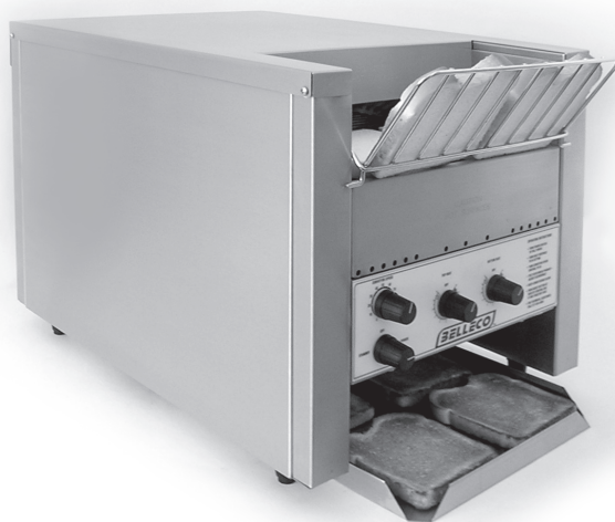
MODEL JT2 SHOWN