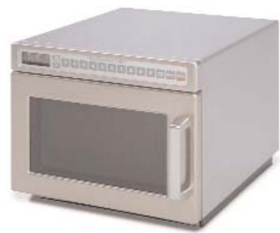
Model MDC12A2 shown