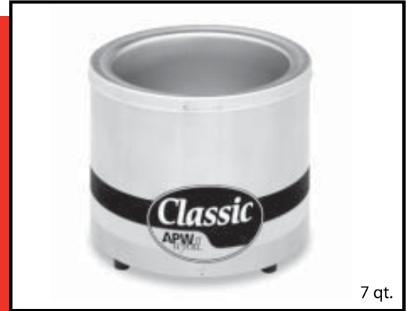
MODEL RW-1V COUNTERTOP ROUND WARMER