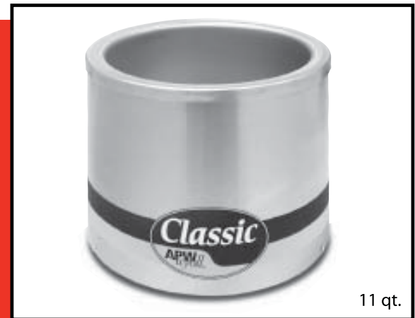
MODEL RW-2V COUNTERTOP ROUND WARMER